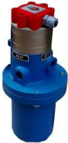
Fuel Flow Sensor

For Construction / Mining / Transportation Industry Installation on Excavators / Tipper / Cranes / Hyva / Loaders / Dumpers