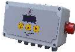
Data Collector Unit (DCU)