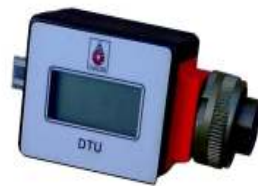
Data Transmission Unit (DTU)