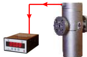
Remote W/P Indicator Rate + Totaliser