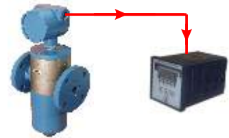
Remote W/P Indicator Rate + Totaliser + 20 mA Analog Output or Rs485 Serial Output